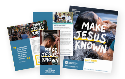
Chinese, English, Korean, Spanish